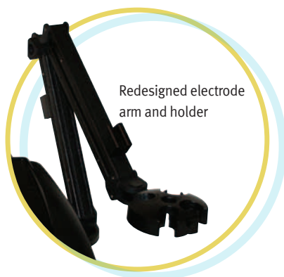
Redesigned electrode arm and holder

Certified System Thermo Fisher Scientific Water Analysis Instruments Chelmsford, MA USA Quality Management System Registered to ISO 9001